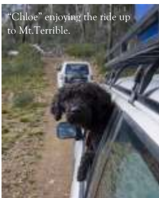
"Chloe" enjoying the ride up to Mt. Terrible.