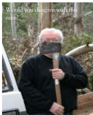
Would you disagree with this man?

Next meeting: 15th September Ringwood Interclub